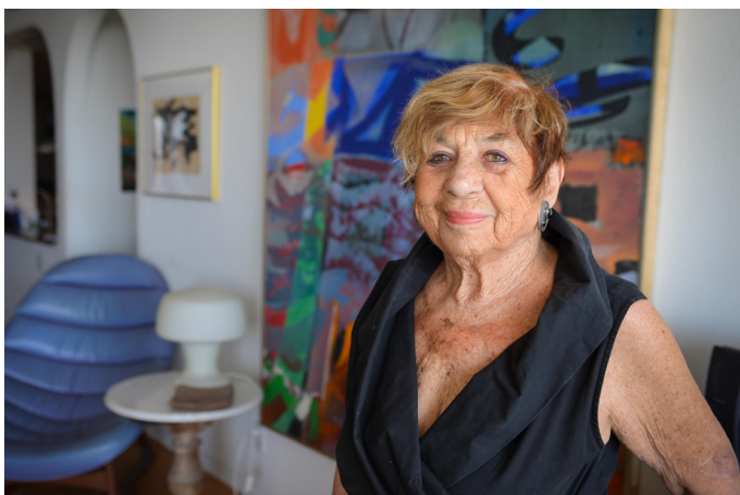
Sarasota Herald Tribune