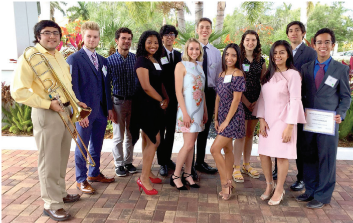
2019 Scholarship Awards