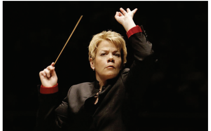
Marin Alsop, Baltimore Symphony