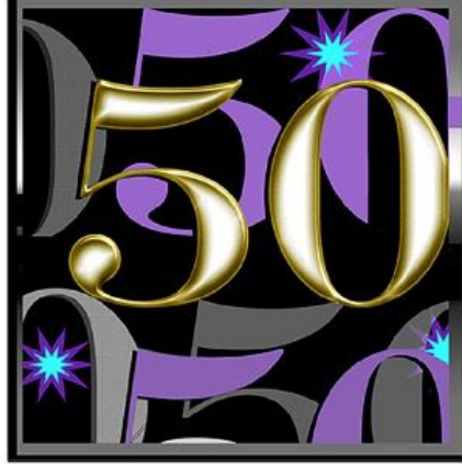
FINE ARTS SOCIETY