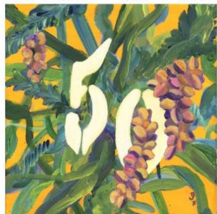
FINE ARTS SOCIETY