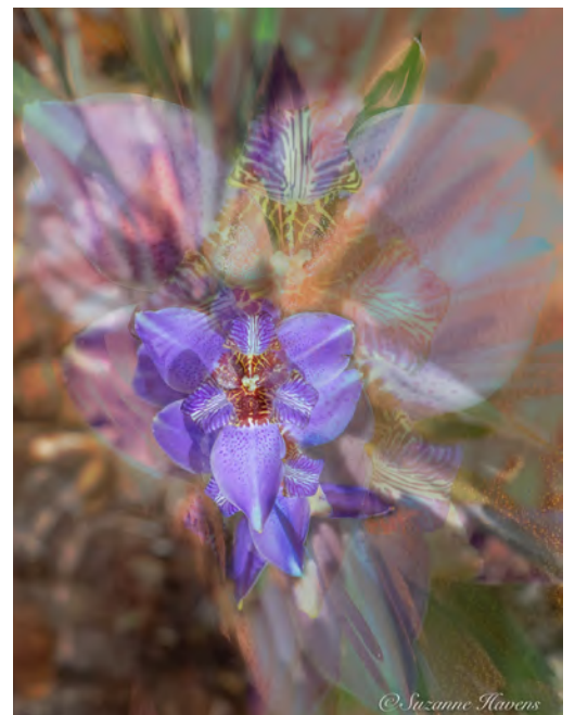
Top: Bullet in Space Right: Walking Iris