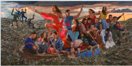
Three examples of updated versions of the iconic painting