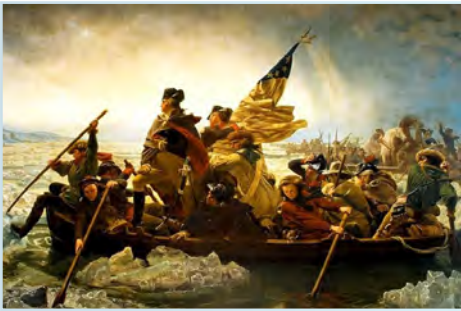
Emanuel Leutze's original "Washington Crossing the Delaware"